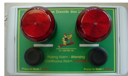
Model: Canary DRAM

Requirements: 2 Monitors and 2 Alarm Units