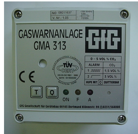
Model: GfG GMA313