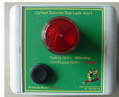
Model: Canary CRAM